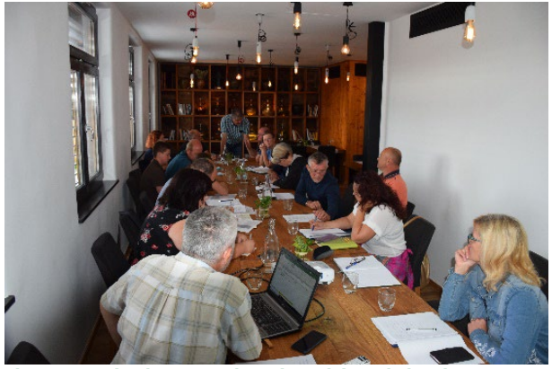
The cooperation between Slovenian advisors helps them cover a broad spectrum of knowledge, and strengthens their connections with farmers, rural communities and innovative projects. Here: Farmers and other partners in an EIP-AGRI Operational Group project meet.