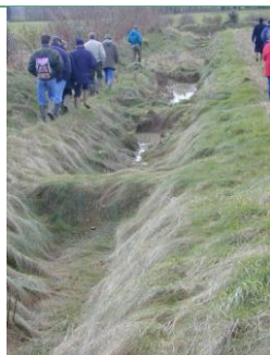
Grassy strip against erosion & flooding (Pays de Caux, Normandy, France)