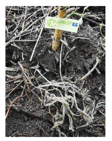
Figure 8. Testing the composting of bio degradable twine for its further use in bean production. Picture after 11 weeks of composting (LIFE BioTHOP PLA twine, 2020, Photo: Čeh, B.)