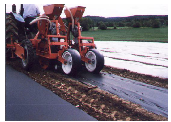
Figure 1. The laying of biodegradable mulching film in the field (BioBag, 2020).

The replacement of conventional agricultural plastics by organic products like bark or wood chips is not common because of access to the materials and concerns about their efficacy – there is consequently a demand to develop new plastics that will have a lower environmental footprint. A range of biodegradable materials have been developed for purposes such as mulches (Figure 1) and pots (Figure 2) but work is continuing to make them more cost effective whilst ensuring that their production and use really is sustainable.