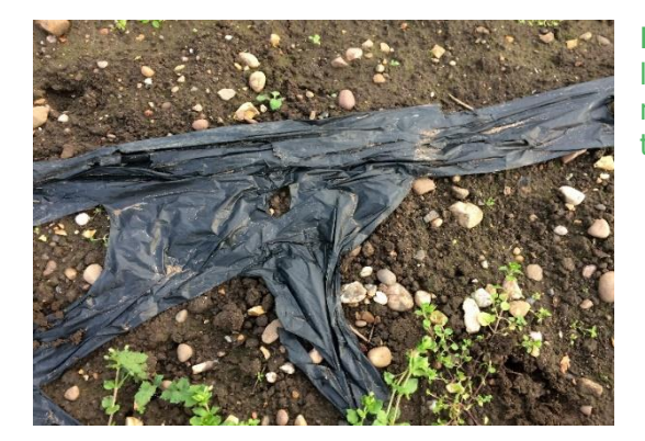
Figure 5. After harvest the commercial PLA film remained largely intact on the surface, except where it had been mechanically damaged although it had degraded at the sides of the bed where it was tucked into the ground

In this section several 'case study' examples from several farming systems (e.g. field vegetables, polytunnels, dairy production) in locations across Europe are presented. Good practices described below also show the importance of the certification of biodegradable plastic used in the European agriculture.