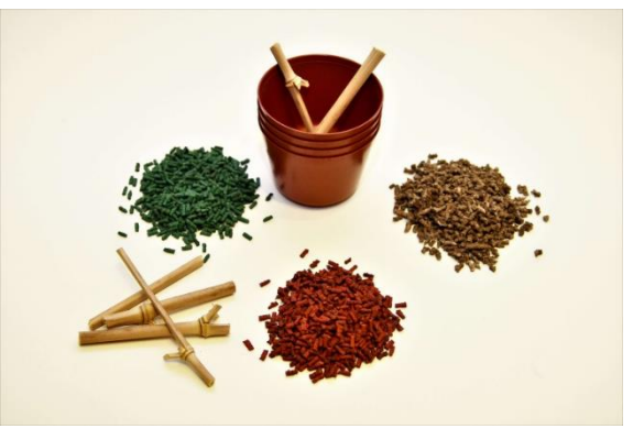
Figure 2. Evegreen biodegradable flower pots (Evegreen Ltd, 2020).