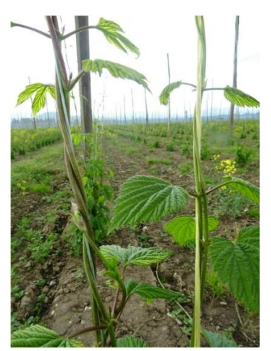
Figure 7. Testing of biodegradable twine in hop fields in Slovenia (LIFE BioTHOP Brochure, 2020, Photo: Čeh. B.)

LIFE BioTHOP project : Slovenian hop producers/farmers are using 100 % biodegradable twine for securing the hop plants (Figure 7). The aim of this project is to replace the PP twine in the hop fields with the biotwine made of a renewable material, polylactic acid (PLA), that can be degraded by on-farm composting together with the hop plant biomass for use as a soil amendment (Figure 8 and 9). Alternatively hop biomass after harvest can be used not only for compost but also as raw material (Figure 10) to produce range of biodegradable products (e.g. bio-composites for planting pots (Figure 11), and packaging trays). This 'upcycling' adds considerable value to what would otherwise be a farm waste. The demonstration region is Lower Savinja valley in Slovenia, and it presents an example of good practice for all hop-growing regions not only in the EU but also across the world. The goal of the project is to follow the circular economy and resource efficiency and to completely upcycle the hop waste in hop production and to improve energy efficiency by 25 % by using the biopolymeric composites. Considering the emission of the greenhouse gasses a great reduction compared to conventional plastic production is expected. https://www.life-biothop.eu/