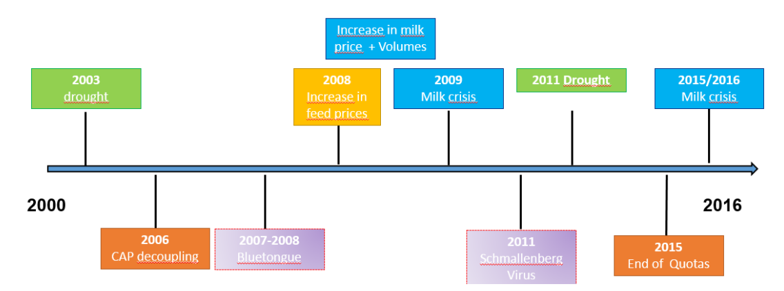
Table: Hazards and external events faced by French dairy farmers (Fagon et al, under press)