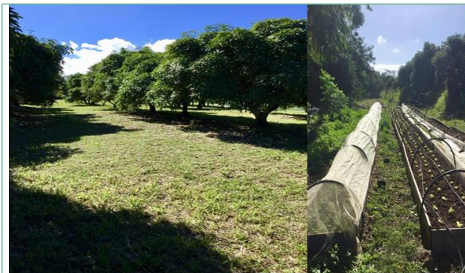
Figure 2. Surrounded by a dense ravine rich in biodiversity (endemic, exotic and plant pests), the farmer benefits from a natural barrier and a permanent reservoir of insects necessary for the conservation (Photo and contribution by Sandrine Baud)