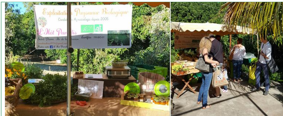
Figure 11: Direct sale marketing in Reunion Island