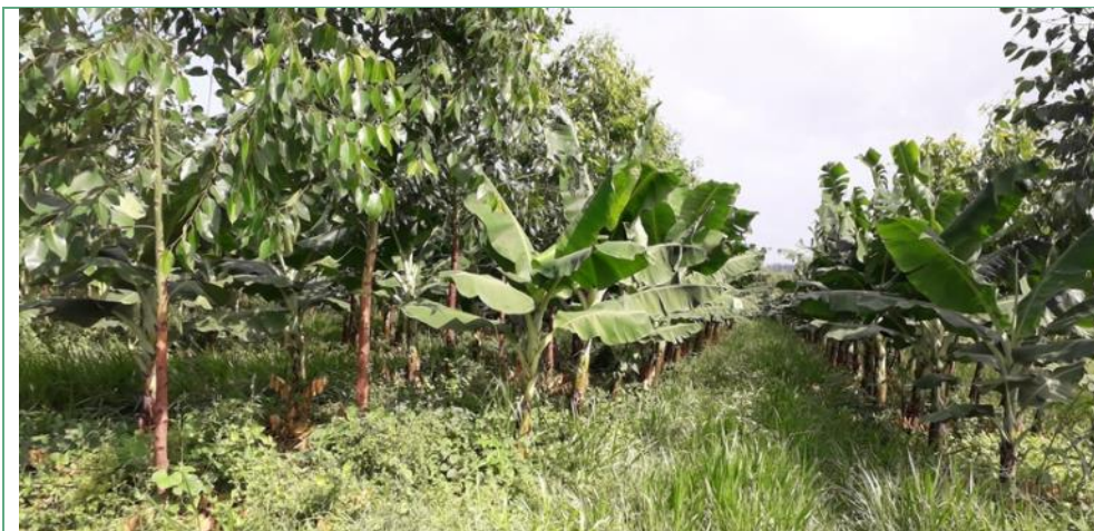
Figure 1. Agroforestry in banana-based farming systems in Martinique.

Martinique: The highly diverse ecosystems support tourism and the economy of the island. Based on AFD (2020) the island is facing economic problems making the adoption of successful farming systems a smart option to counteract unemployment. Agroforestry is an ideal farming system for tropical regions and there are many examples that can be adopted by local farmers. In a study by Archimede et al. (2012) it is mentioned that banana farms can be switched to mixed farming systems with ruminants feeding banana by-products.