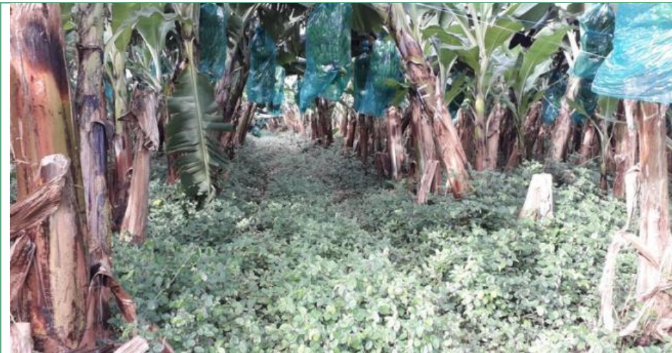
Figure 7. Associated crop in Banana production in Martinique