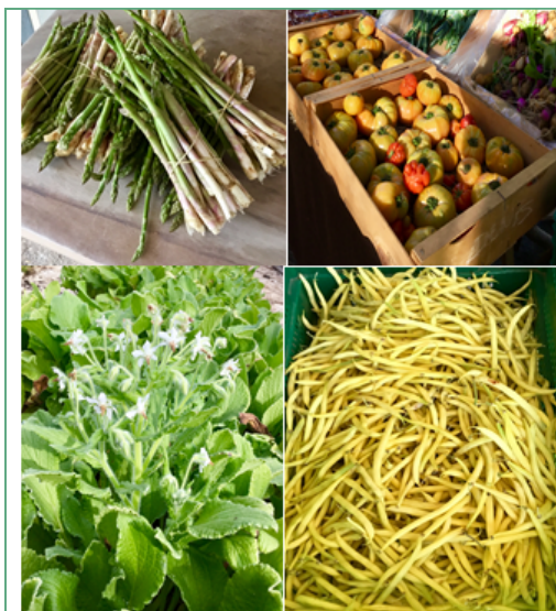
Figure 1. A variety of products is produced on the farm