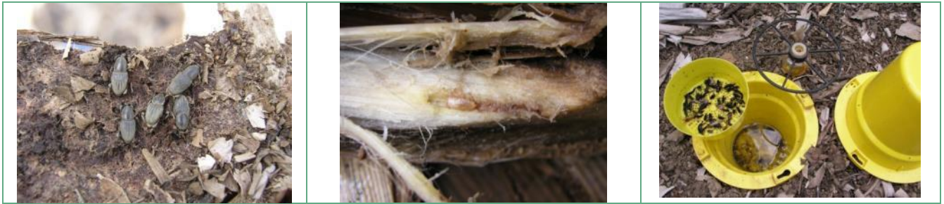
● Use of Tephri and Ceratrap traps with food attractants in monitoring and fighting against the Ceratitits capitata (frui fly) adults in Azores Islands citrus orchards.