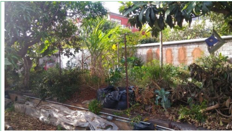
Figure 6: Food forest following the permaculture practices producing tropical fruits, grapes, diverse vegetables, edible flowers, and aromatic plants. The system production is based on zero inputs, and biomass and waste is used to recycle the nutrients and maintain soil fertility. The plagues control is achieved through the promotion of friendly and auxiliary biodiversity