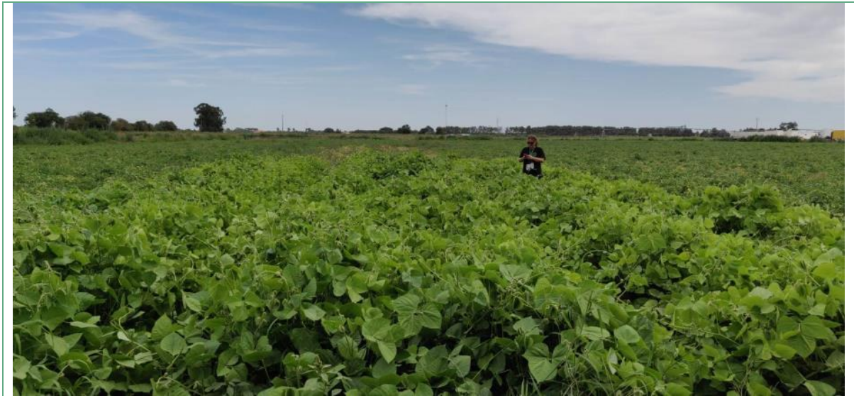
Figure 9. Association of tropical species Lablab purpureus L. intercropped with tomato for industry in Portugal. Tomato rows are irrigated and lab lab rows are not.