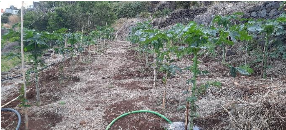
Figure 5. Fruit production mixed system join together subtropical fruit crops (papaya, mango, avocado, banana, avocado and citrus) and vegetable crops (sweet potato and sugarcane) using different cropping strategies (mixed, row, strip and alley) to increase land area use, and the ravines and bordures on the farm have a rich native vegetation and biodiversity, acting as natural barriers against undesired impacts caused from extreme weather events and pests (Photo and contribution João Coelho)