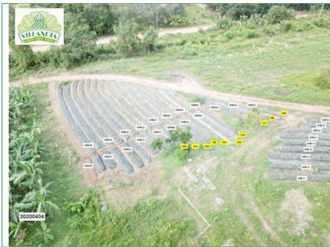
Figure 11: Aerial photo helping monitor crop progress