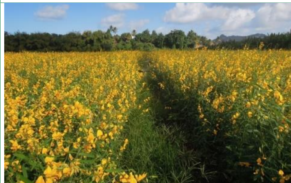
Figure 8. Implementation of Crotalaria spp to control soil nematodes before pineapple crop in Martinique