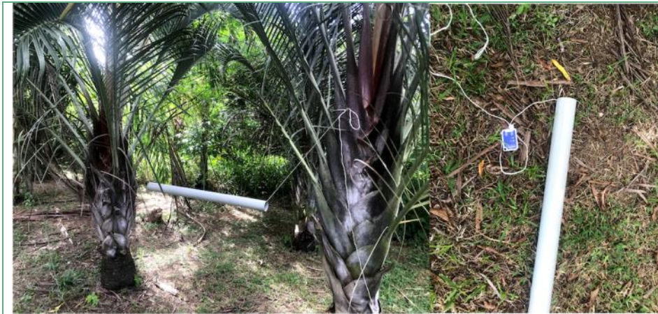
Figure 10: Temperature recording in the shade with a LogTag® temperature data logger