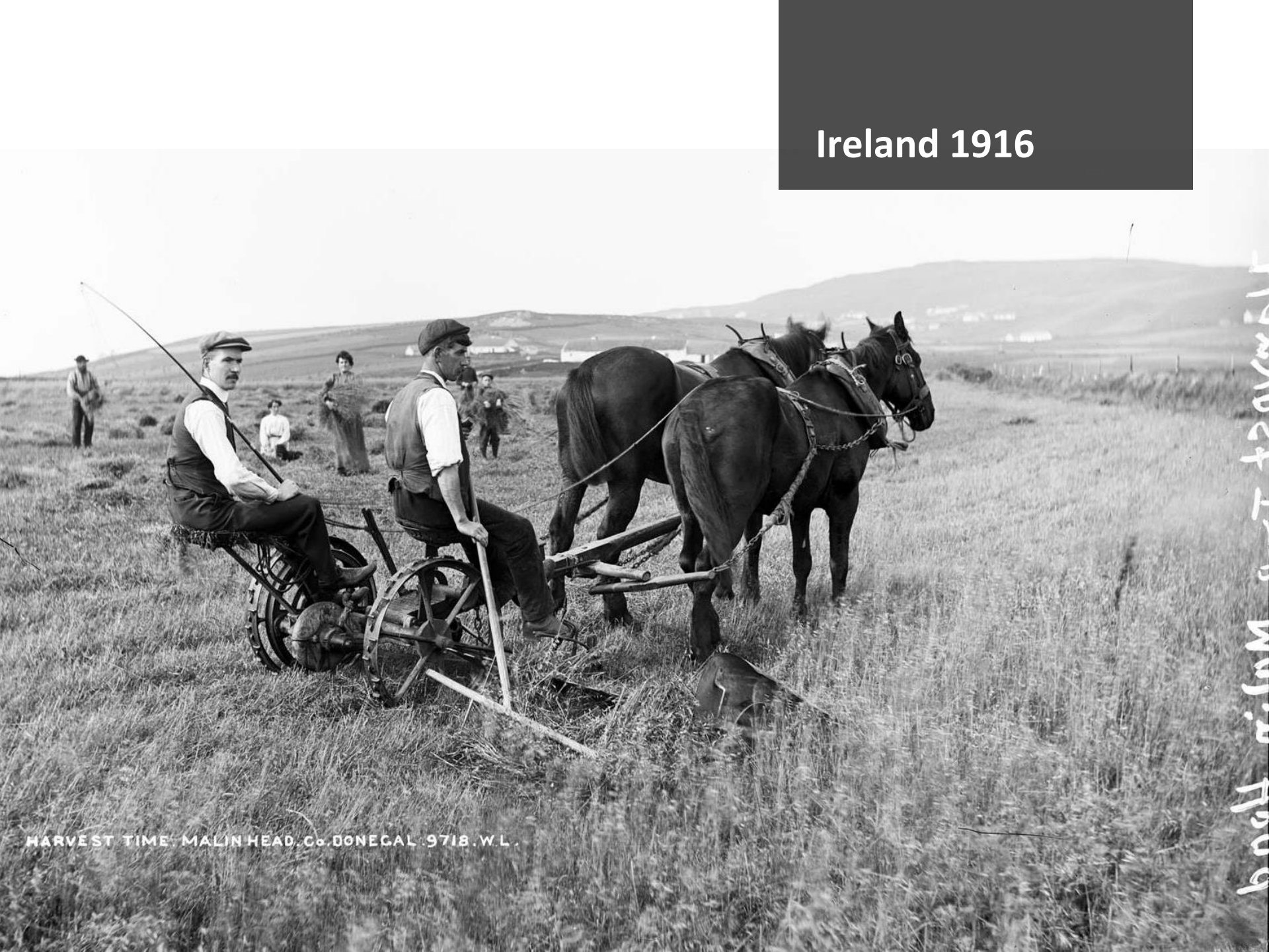
HARVEST TIME. MALIN HEAD, Co. DONEGAL. 9718.